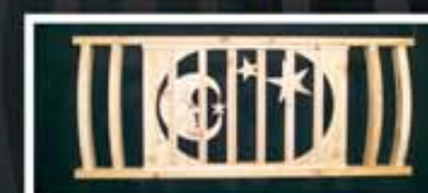
BOWED SPINDLES W/ANY 3FT SCENIC INSERT