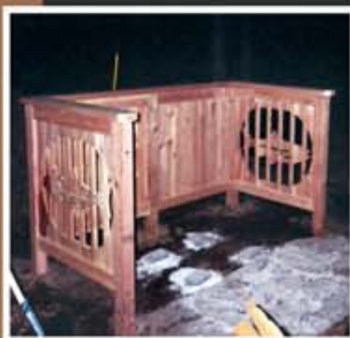
Use scenic inserts to hide any obstructions on your property