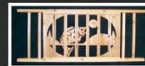
YORKSHIRE W/ANY 3FT SCENIC INSERT