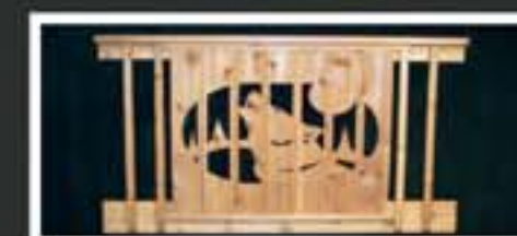
TRADITIONAL W/ANY 3FT SCENIC INSERT