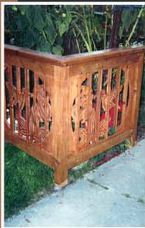
Enhance your landscape