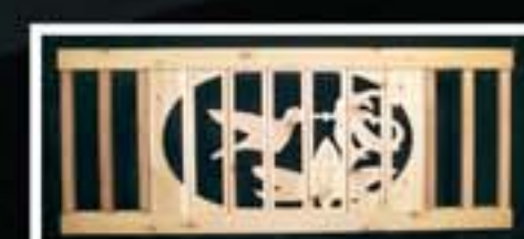
SANDWICH STYLE W/ANY 3FT SCENIC INSERT